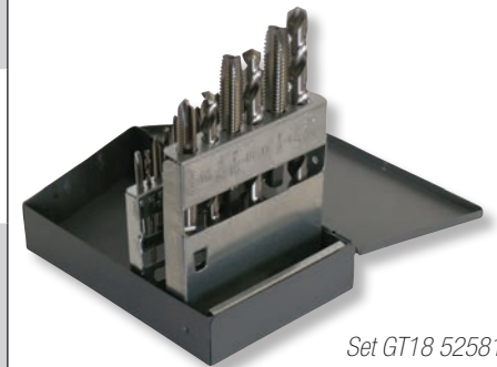
Set GT18 52581